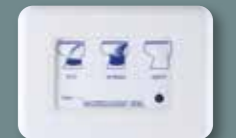
Electronic keyboard Luxe